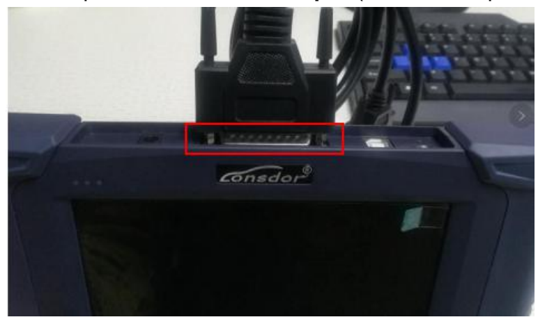
Pic 2: Metal part on K518ISE OBD port