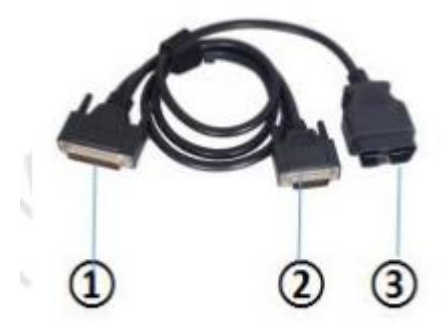
Pic 1: 3 connectors on OBD cable

Connector 1: connect K518ISE OBD port; Connector 2: connect KPROG adaptor Connector 3: connect the vehicle OBD port