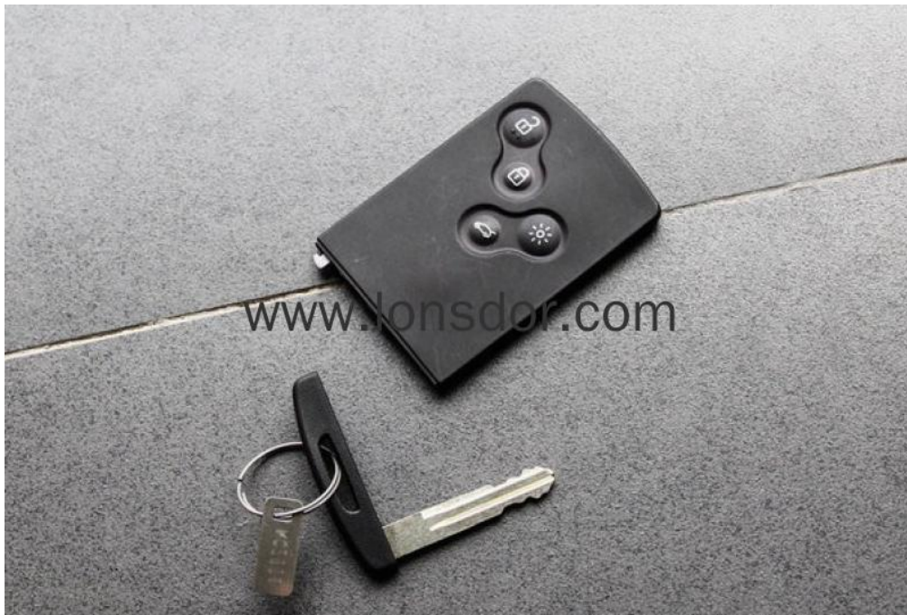
For Keleos smart key, the induction key slot lies in front of the gear: